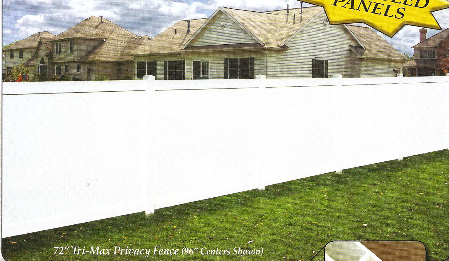
72" Tri-Max Privacy Fence (96" Centers Shown)