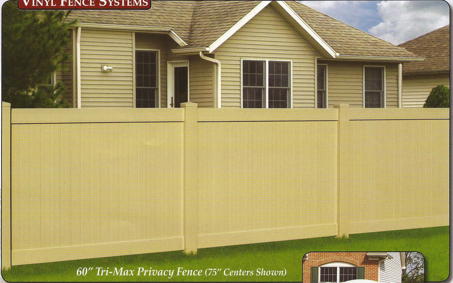
60" Tri-Max Privacy Fence (75" Centers Shown)