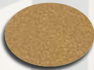
Gold Accent DSI 110

§ Lifetime Limited Warranty for end users. 30-Year for Government, Municipalities and Corporations.