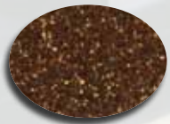
Speckled Walnut DSI 121